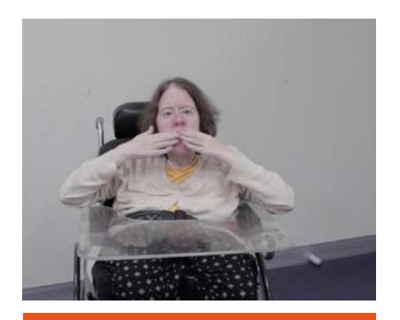
All of the Above

Our world, our shorts. Come and see these compelling short films made by emerging filmmakers with disability based in Australia, where they show their worlds as they are.