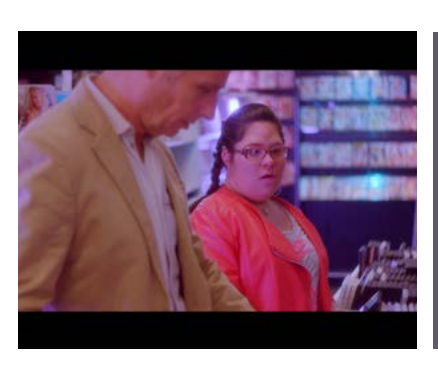
Let me know

A dystopian look into the future of home help service.