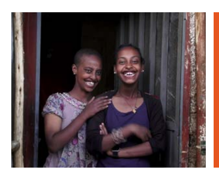
Here & There

This screening features provocative and powerful films by, about and with people with disability about their lived experience of disability.