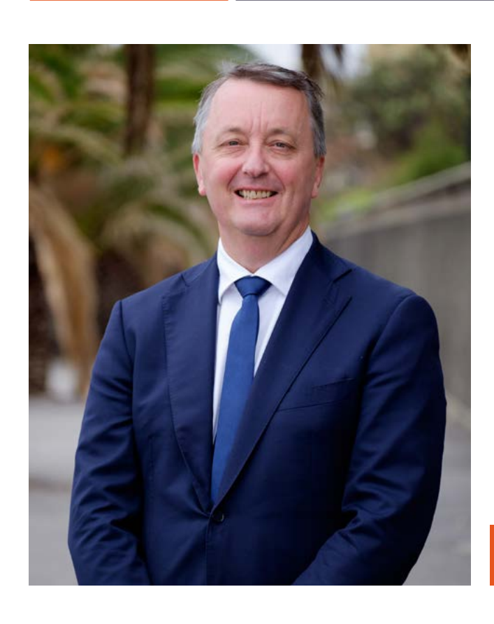
Martin Foley MP, Minister for Creative Industries

Film is a powerful medium for challenging perspectives, for creating conversations and for opening windows into the lives of others – never is this more evident than with The Other Film Festival.