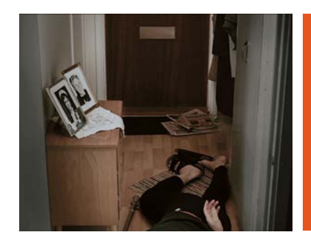
Home Care Before Christmas